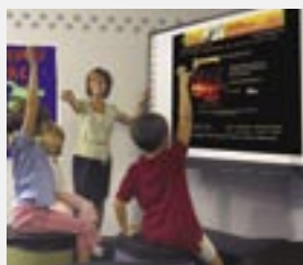
Interruption-free meetings and classes