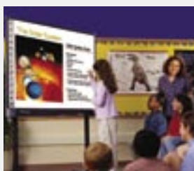
Improve Group Interactivity