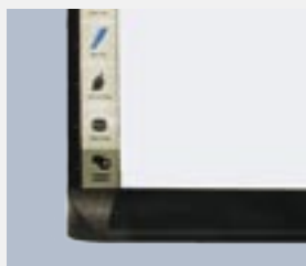
Interactive Projection on a Touch-sensitive Surface